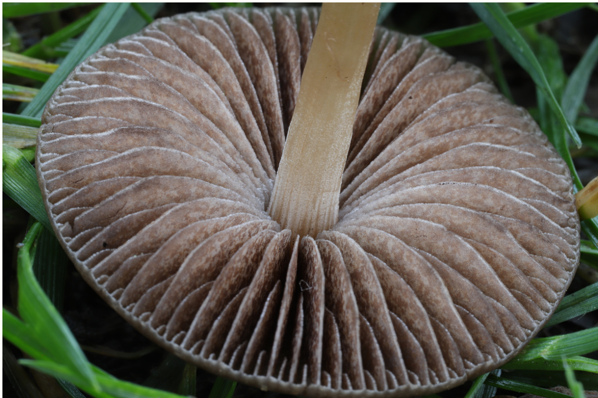
Panaeolus foenisecii